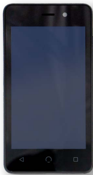
Insulet Omnipod Dash