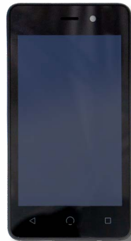
Insulet Omnipod Dash