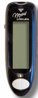
GlucRx Nexus mini ultra

For specific instructions on how to upload these new devices, please refer to the Quick Guide for clinics at: https://support.diasend.com