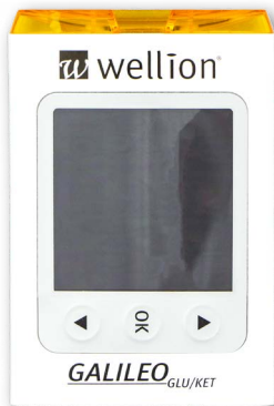
Wellion GALILEO GLU/KET